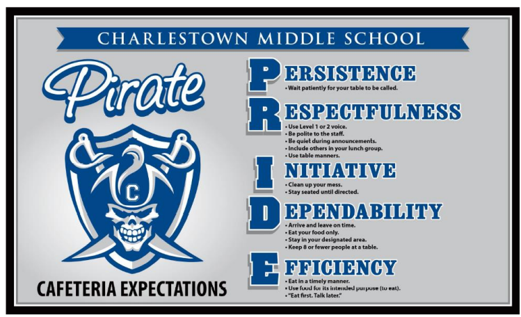
REMEMBER - EVERYONE IS RESPONSIBLE FOR CLEAN UP